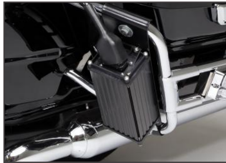
100 Watt Siren and Mounting Bracket Kit Includes Harley Davidson® wiring harness, four tones, and public address. Microphone purchased separately.