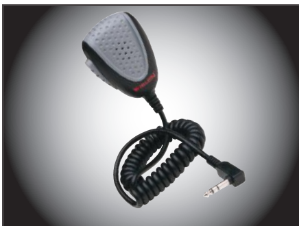
Microphone for WS321 Noise canceling microphone