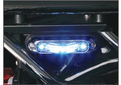
Surface Mount ION™ Under Radio Box Mount Kit

Under Radio Box Mounting Bracket Kit for one ION or ION V-Series™ surface mount lighthead. Available in curb side or road side in Black.